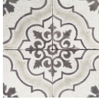
Alcazar Cinza Antique Matte Crackle MAJ-6X6-ALCAZCI-AMC