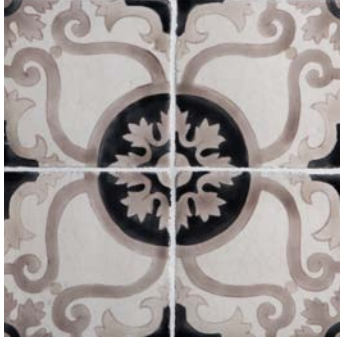
Lisbon Cinza Antique Matte Crackle MAJ-6X6-LISBOCIN-AMC