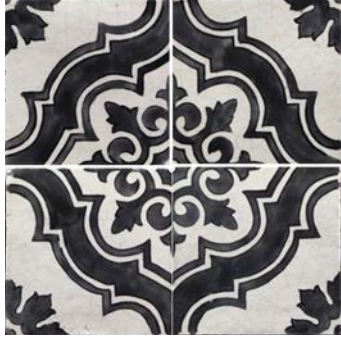
Alcazar Tinta Antique Matte Crackle MAJ-6X6-ALCAZTI-AMC