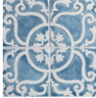
Lisbon Atlantica Antique Gloss Crackle MAJ-6X6-LISBOATL-AGC