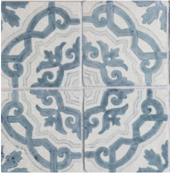
Amalfi Azul Antique Gloss Crackle MAJ-6X6-AMALFAZU-AGC