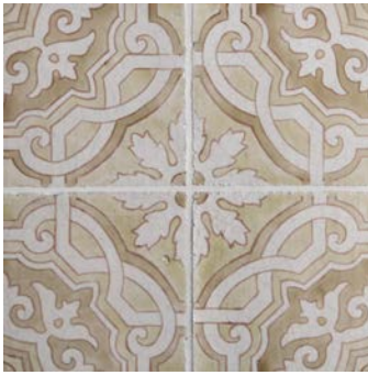
Amalfi Verde Antique Matte Crackle MAJ-6X6-AMALFVER-AMC